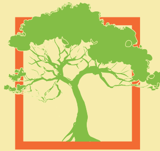
BROCHURE UPDATED FEBRUARY 2016

FOR THE LATEST INFORMATION, MAPS, AND UPDATES ON RAPID 'ŌHI'A DEATH PLEASE VISIT: